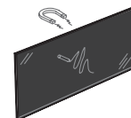
Magnetic Glass (M)