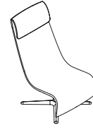
High-back Without Arms