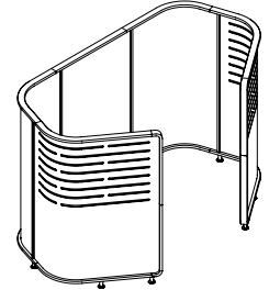
Wing Panels, Partial Slots