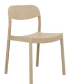
Laru Side Chair (NOLLN)