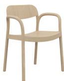
Laru Arm Chair (NOLAN)