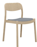
Laru Side Chair, Upholstered Seat (NOLLY)