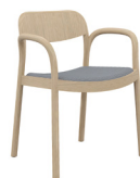
Laru Arm Chair, Upholstered Seat (NOLAY)