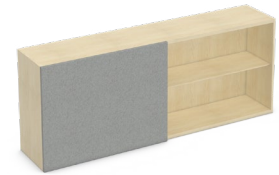
Overhead Sliding Door COSD

Height: 1 High (1H), 2 High (2H) Depth: 15" Widths: 54" - 108" in 6" increments