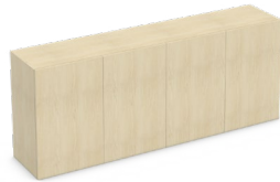
Overhead, Hinged Doors COHD

Height: 1 High (1H), 2 High (2H) Depth: 15" Widths: 30" - 108" in 6" increments