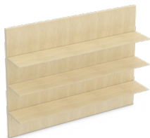
Open Wall Shelves CWOH

Height: 1 High (1H), 2 High (2H) Depth: 15" Widths: 54" - 108" in 6" increments