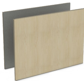
Wall Panel, above Low Credenza CWPL

Height: 1 High (1H), 2 High (2H) 3 High (3H), 4 High (4H) Widths: 24" - 90" in 6" increments