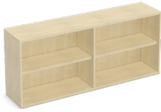
Overhead, Open COOP

Height: 1 High (1H), 2 High (2H) Depth: 15" Widths: 30" - 108" in 6" increments