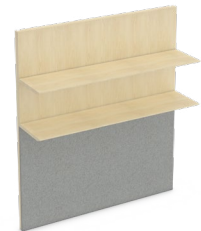
Combination Open Shelves & Lower Panel, above Low Credenzas CWCL

Height: 3 High (3H), 4 High (4H) Depth: 15" Widths: 24" - 108" in 6" increments