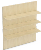
Open Wall Shelves, above Low Credenza CWOL

Height: 3 High (3H), 4 High (4H) Depth: 15" Widths: 24" - 108" in 6" increments