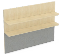
Combination Open Shelves & Lower Panel CWCH

Height: 3 High (3L), 4 High (4L) Depth: 15" Widths: 24" - 78" in 6" increments