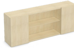
Overhead Hinged Doors with Cubby COHC

Height: 1 High (1H), 2 High (2H) Depth: 15" Widths: 30" - 108" in 6" increments