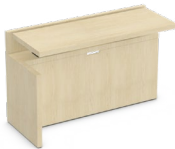
Shown: Left Gable, Right Cabinet Anchored (L)