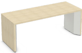
Height-Adjustable Desk CHDH