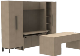
Height-Adjustable Workwall Shell CHWH, CHWL