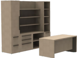
Height-Adjustable Desk CHDH

Height-Adjustable options range from a freestanding desk to model that integrate into a office suite configuration.