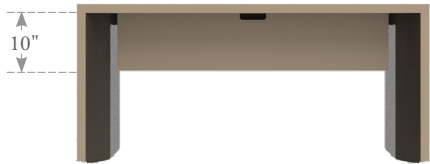
10" height Modesty