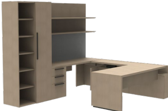
3-Point Height-Adjustable CH3H, CH3L