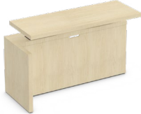
Shown: Left Gable, Right Cabinet Anchored (L)