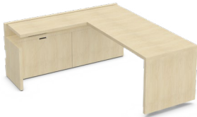
3-Point Height-Adjustable CH3H