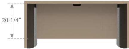
20-1/4" height Modesty

All modesties have a central cut out for cable management from desk edge clamp accessories specified separately.