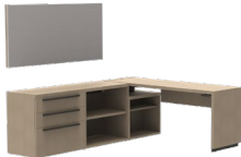
Height-Adjustable Run-Off with Workwall Cabinet CHRH, CHRL