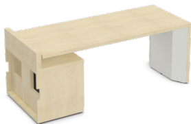
Height-Adjustable Run-Off with Workwall Cabinet CHRH