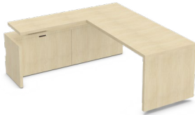
Shown: Left Hand, With Gable (L)