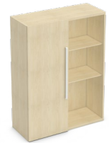
Double Stacker, above Low Credenzas (CS2L)