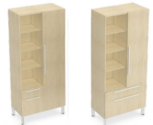
Double Combination Wardrobe Tower, Elevated (CTWE)