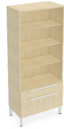
Double Combination Tower, Elevated (CTCE)