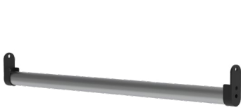
Coat Rod Chrome