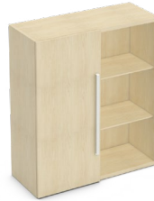
Double Stacker CS2H