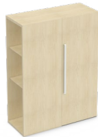
Side Access Stacker, above Low Credenza (CSSL)