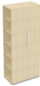
Shown: Left Side Access Open Shelves, Right Hinged Door (SH)