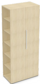
Double Side Access Tower (CTSS)