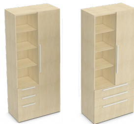
Double Combination Wardrobe Tower (CTWS)