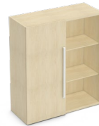
Double Stacker (CS2H)