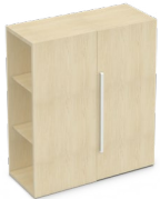
Side Access Stacker (CSSH)