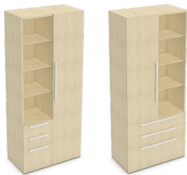
Double Split Combination Tower (CTPS)