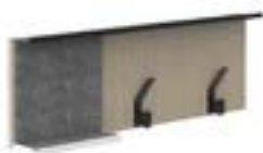
Hooks, Upper Shelf (L/R) (right shown)