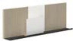
Lower Shelf with Dividers (C)