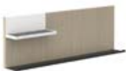
Lower Shelf with Tray (B)