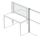
Corner Post Connection