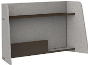
Finish: Guided Ash