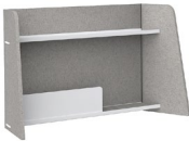
Finish: Atrium White